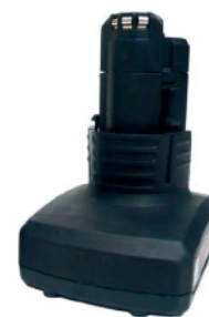
Pacco batteria (2 inclusi) 5800mAh

The latest generation battery works with lithium-ion technology and is capable of developing 5.2 Ah 110-240V DC10.8V Li-Ion.